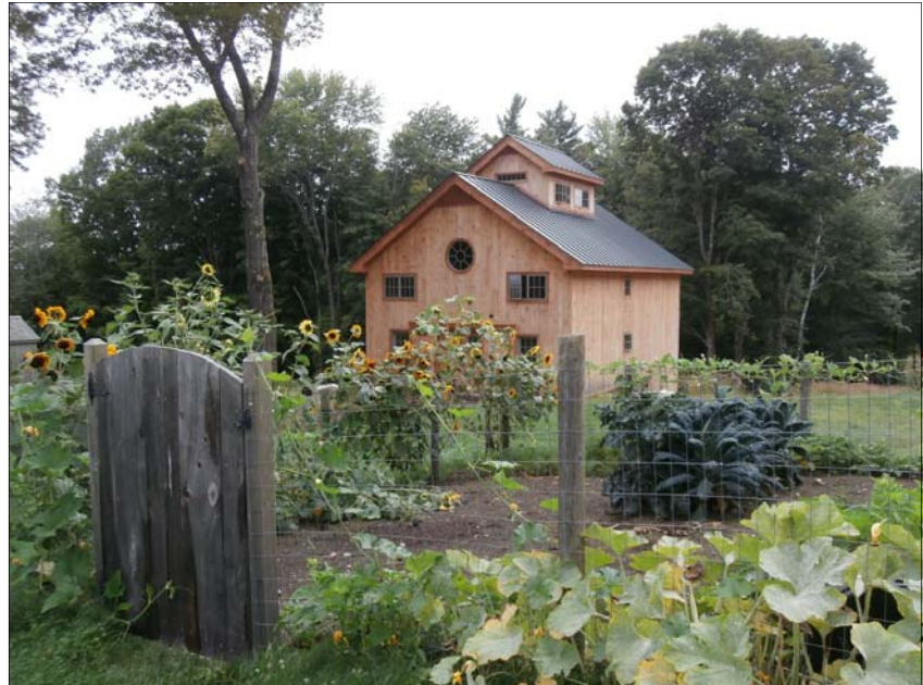
The new barn at Nye Hill Farm