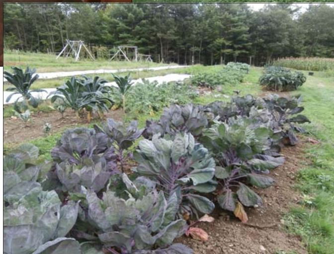
Vegetables growing last summer