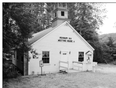
A rendition of the proposed change

The structure was built in 1849, replacing the original meetinghouse that had been built in 1804; it was the construction of that first meetinghouse that led to Roxbury's incorporation in 1812. The Congregational Society used the building as a place of worship through the 1930s, after which it began to fall into disrepair. It was the last building standing in Roxbury Center village until vandals all but finished it off in the late 1950s. Roxbury voters then decided to dismantle it. At the time of the demolition, then Selectman Bill Yardley took note of the fact that the steeple remained intact, and he asked his neighbor, Seaver Gilcreast Sr., whether he