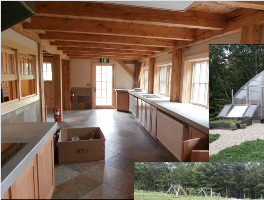
The brewery in early days