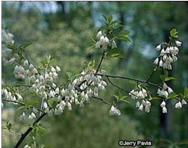
A branch of a Carolina silverbell tree.

The largest Carolina silverbell tree in America grows in Roxbury! Not common in New England, the silverbell's best feature is its white bell-shaped flowers in the Spring. The latest edition of the Register of Big Trees, published by the conservation organization American Forests, lists the silverbell tree at Westover Farm on Dillingham Road as the reigning national champion. The previous champion, in the Great Smoky Mountains National Park, evidently died. Determining the "biggest" tree depends on the height (in feet), circumference at breast height (in inches), and spread of the branches (in feet). The three numbers are added together to produce the tree's "points". The Roxbury tree is 68 feet high, 129 inches circumference, and spreads 66 feet. The runner up, in Rochester,