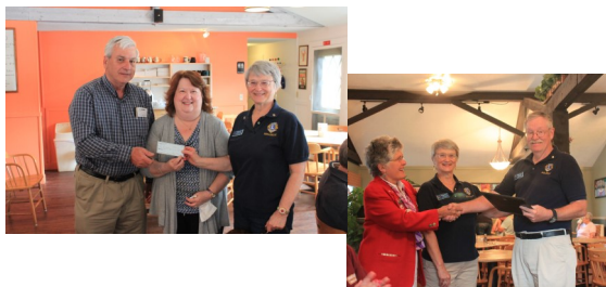
Donations and Awards

The Monadnock Lions Club was chartered in 1960 with 20 charter members. Today we are a growing and thriving club.